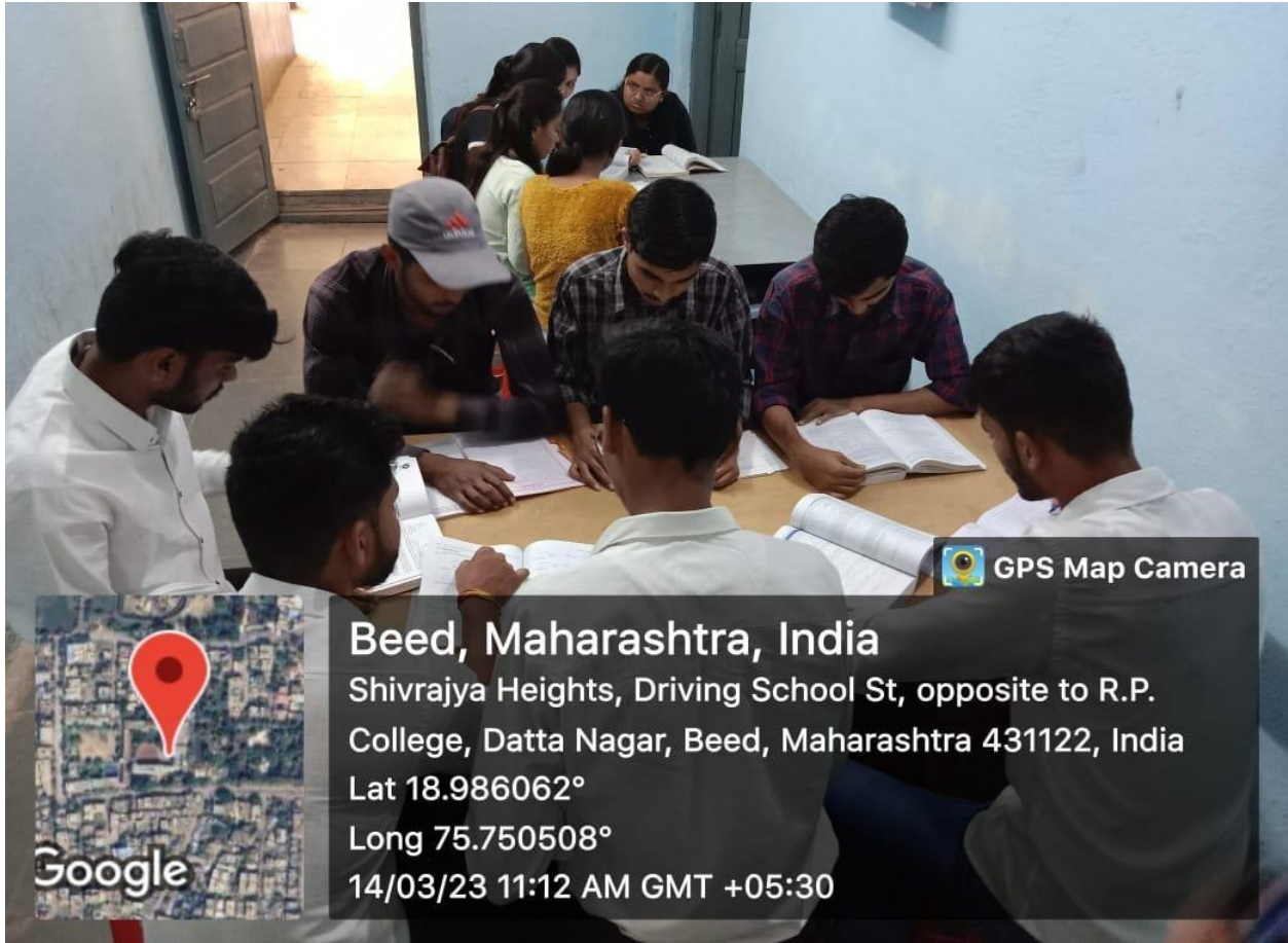
Guest Lecture to the students