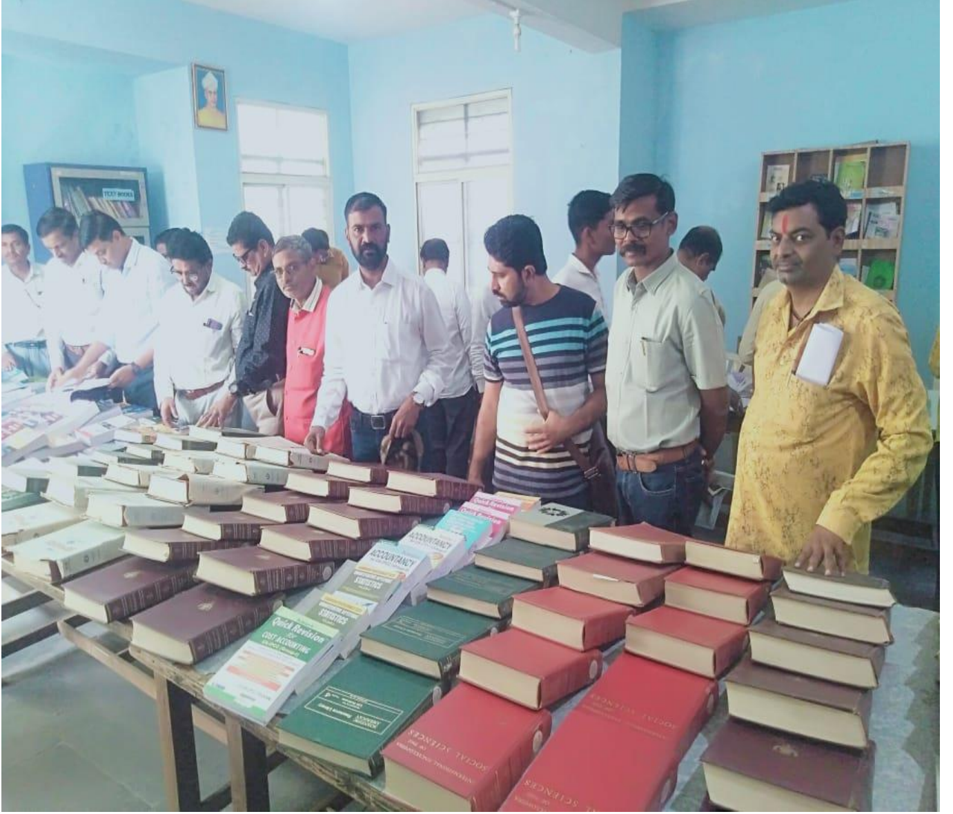
BOOK exhibition on the occasion of वाचना प्रेरणा दिन