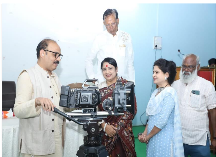
Summery of the event