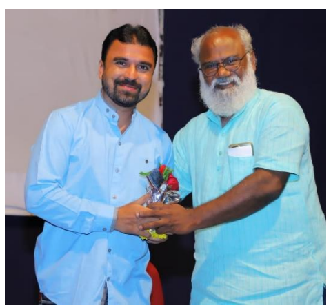
summary of event

Organizing two short film shows 'Lachhi' and 'Pakhar' at KSK college