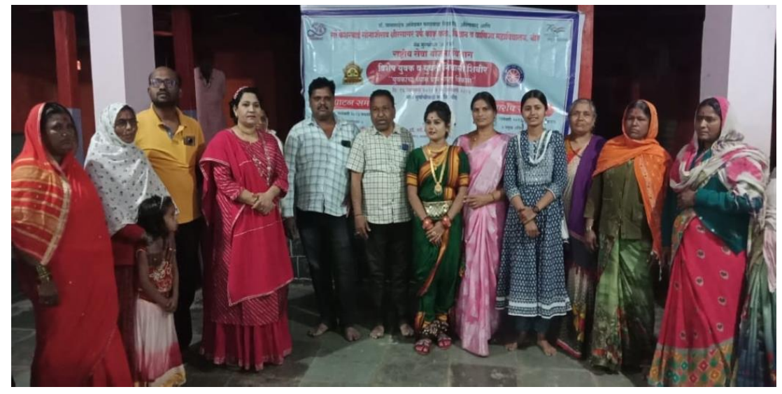
Summary of event

KSK mahavidyala beed aringed by NSS shiber in suryachiwadi this shiber 50 student in participated in this program.students of Drama department Presented ciltural Program at NSS shiber