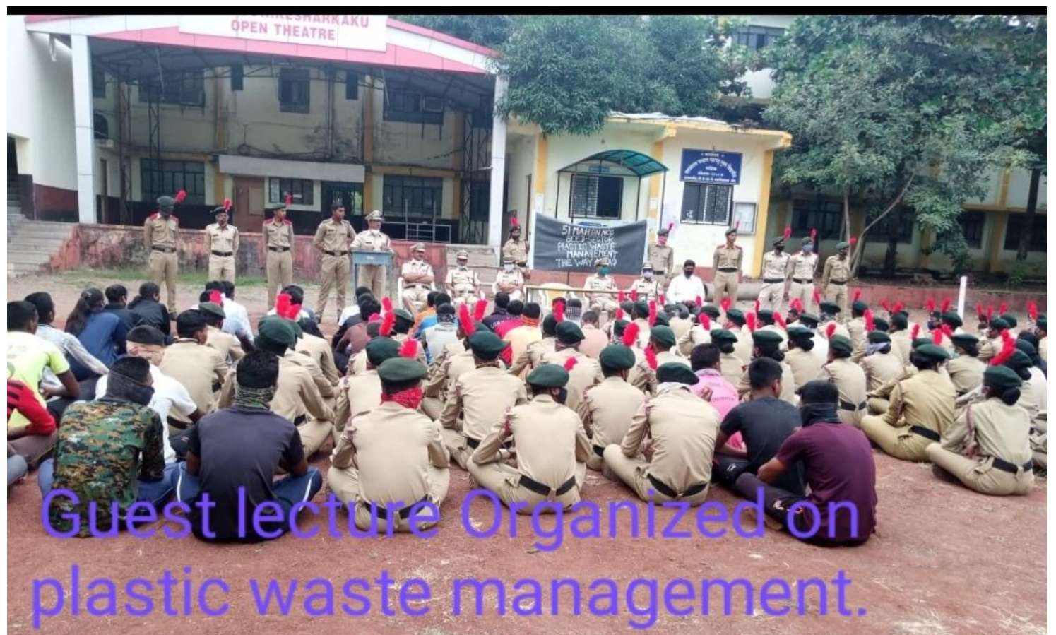
Guest lecture Organized on plastic waste management.